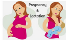
Pregnancy & Lactation